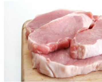
Pork primal cuts.