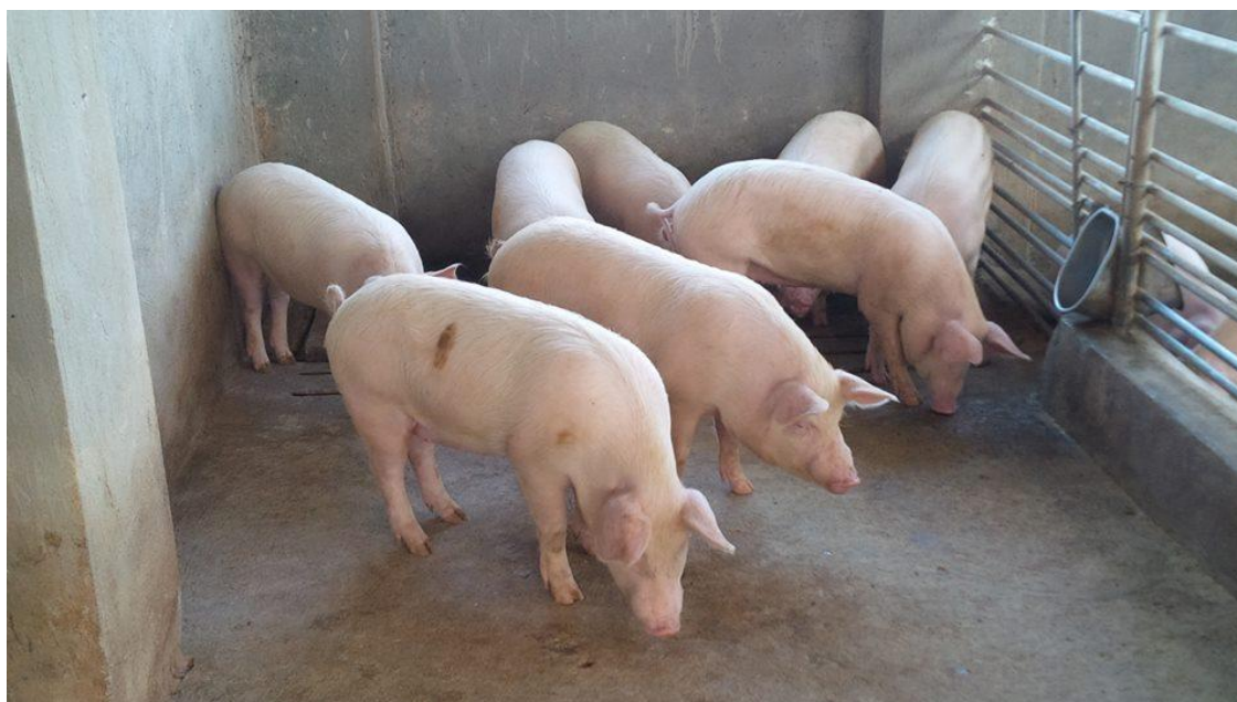
Pigs being fattened for slaughter, Photo credit; Pork City – Nkoko Njeru

system involves marketing of pork or live pigs for slaughter to abattoirs (slaughtering houses). It is a better system to adopt in areas where market for piglets is limited, however it is more capital intensive. Market options include abattoirs and live pig traders. Furthermore, a farmer can decide to operate a pork joint alongside the operation in order to sell their pork directly to consumers.