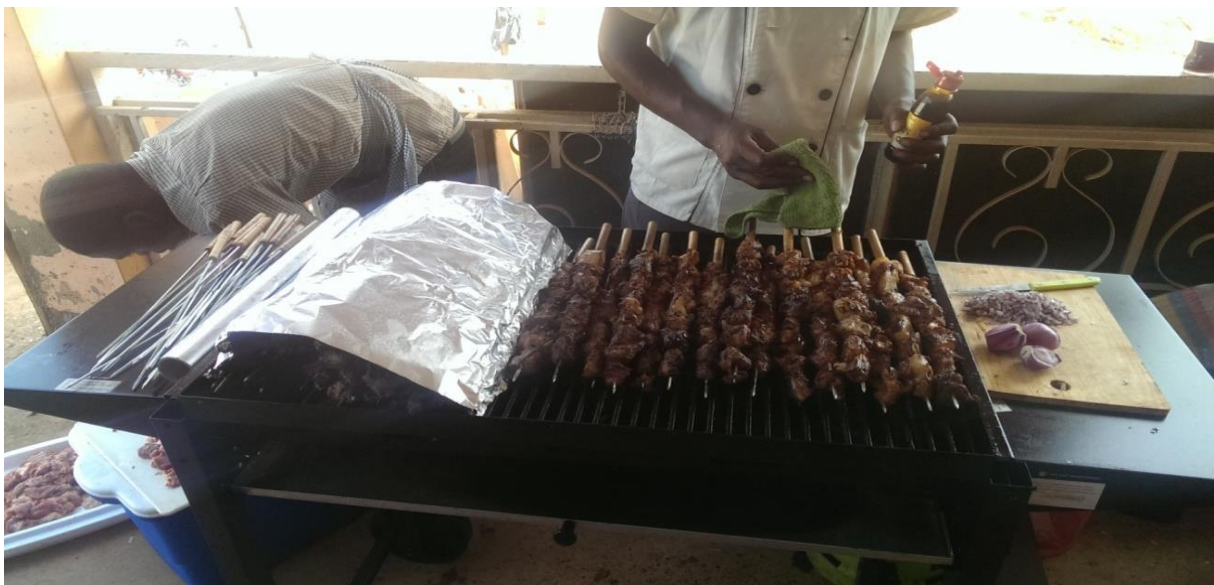
A mobile pork joint.

Before setting up a pork joint, farmers must consider conducting a market research to understand the needs of their customers in terms of quality and quantities. Where a market plan is unavailable, there is risk of overloading the market or, conversely, not having enough pork to satisfy the demand.