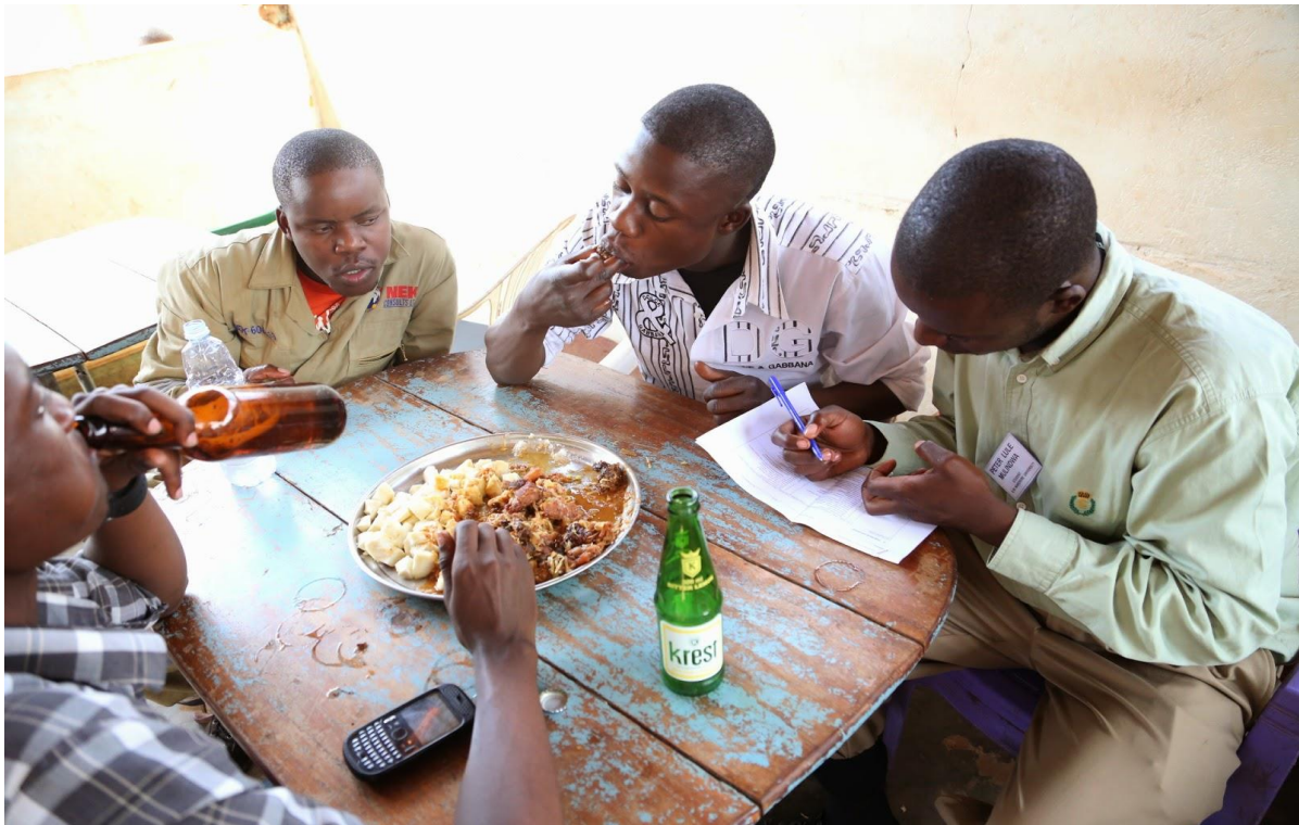
People eating fried pork at a pork joint.