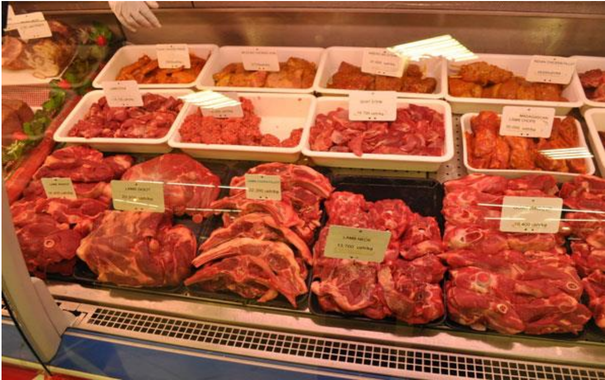
Pork cuts on a supermarket display.